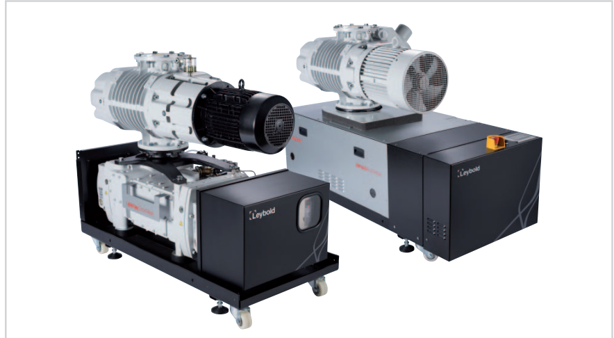
DRYVAC SYSTEMS: Modulare Standard-Vakuumsysteme für unterschiedlichste Anwendungen - kurzfristig lieferbar

ATEX Cat. 3 certified Roots pumps are available for the lines RUVAC WA/WAU 251/501/1001/2001.